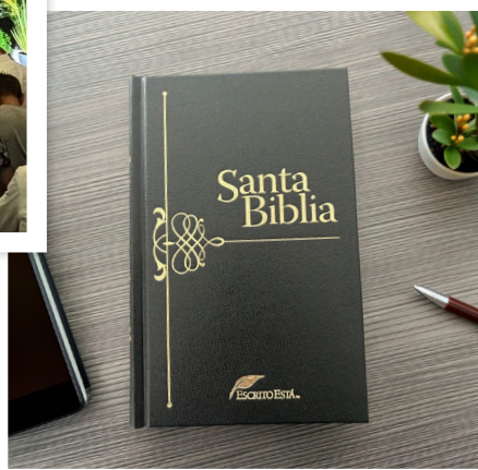
20,000 Spanish-language Bibles have been purchased for distribution in Colombia.

Spanish-language media ministry has been so effective that the church in more cities and countries wants to air Escrito Está on television. The challenge we now face is funding the program in as many markets as request to air it.