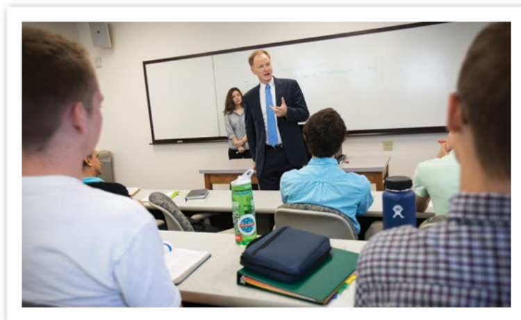
Fall semester SALT students learning field-tested principles.