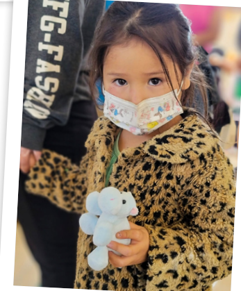
Our April mission trip to Bolivia included vision clinics, VBS, and construction.